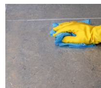
If necessary gently buff with a dry soft cloth or buffing machine.

A one litre LTP Waxwash will wash a 20 sq.m floor 40 times.