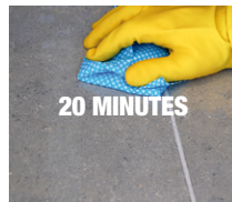
Buff well to remove excess product from the surface. This should be done whilst the solution is still wet on the surface.