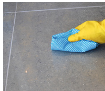
Apply the product to the surface evenly using a sponge, brush or soft cloth.