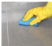
Apply and agitate with an emulsifying pad or scrubbing brush. Under floor heating must be off.