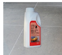
Use LTP Grout Stain Remover to clean off any hard to remove residual grout.