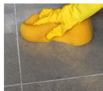
Rinse well with clean water.