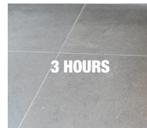
Allow to dry. Do not walk on the surface for at least 3 hours.