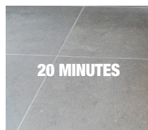
Allow to dry. Do not walk on the surface during drying time – 20 minutes.