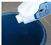
Dilute LTP Grimex 1: 4 with water.

LTP GRIMEX: Cleans and removes factory wax residues, grease, dirt and grime.