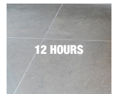
Allow the surface to dry.

EQUIPMENT: Bucket, mop, scrubber or scrubber dryer machine if available.