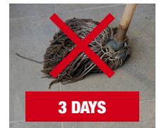
Protect from water for 24 hours and do not wash surfaces for at least 3 days.

EQUIPMENT: Bucket, applicator, brush, cloth.