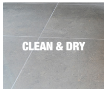
Surfaces must be clean and dry. Under floor heating must be off.

LTP MPG SEALER: Invisible finish – protects against water, oil, grease dirt, grime and aids maintenance.